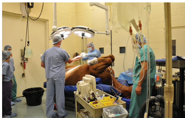
PBEC is renowned for its full-service surgical center and intensive care hospital.

Palm Beach Equine Clinic provides experience, knowledge, availability, and the very best care for its clients. Make Palm Beach Equine Clinic a part of your team! To find out more, please visit www.equineclinic.com or call 561-793-1599.