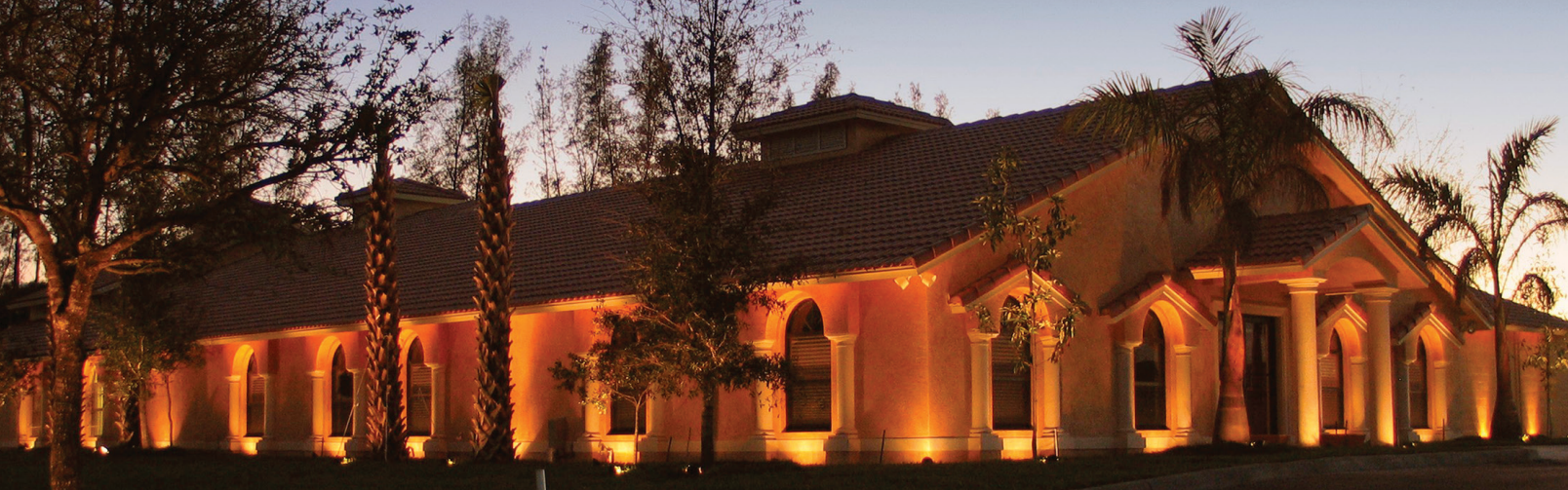
Palm Beach Equine Clinic on a beautiful South Florida night.

From Olympic athlete to trusted trail horse, every equestrian wants the very best for their equine partner. Palm Beach Equine Clinic (PBEC) of Wellington, Florida, offers the best in care for sport horses of every discipline. As an industry leader in equine veterinary care, PBEC features a renowned list of 30 doctors who are experts in their respective fields. The veterinarians and staff are valued throughout the industry for their advanced level of care and steadfast commitment to both horses and their owners.