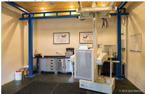
PBEC proudly offers an updated Nuclear Scintigraphy lab to diagnose injuries or bone remodeling within the skeletal anatomy of the horse.